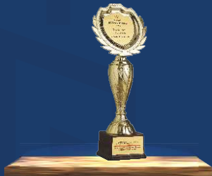
The Best Heritage Bridal Jewellery - Times Retail Icons 2018 -