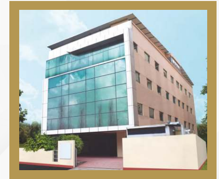
KV TOWER KAVURI HILLS, MADHAPUR