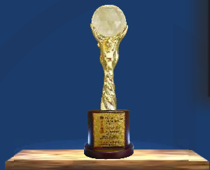
Store Of The Year 2017 - By UBM -