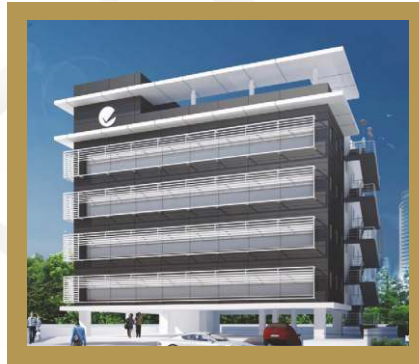
CV TOWER 2 KAVURI HILLS, MADHAPUR