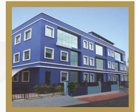
MONSTER.COM JUBILEE HILLS, RD. 45