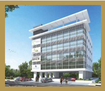
CV TOWER 1 KAVURI HILLS, MADHAPUR