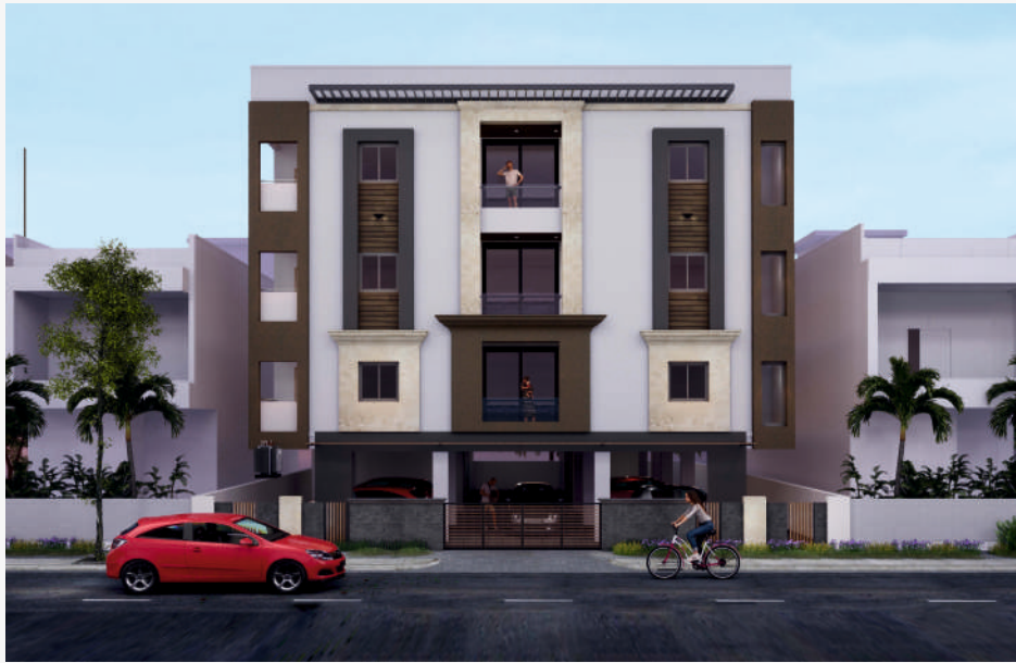
DHRISHA PARK VIEW KARKHANA