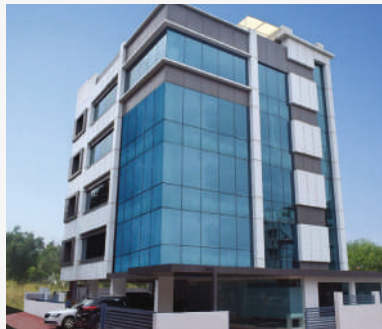
VV TOWER 1 KAVURI HILLS, MADHAPUR