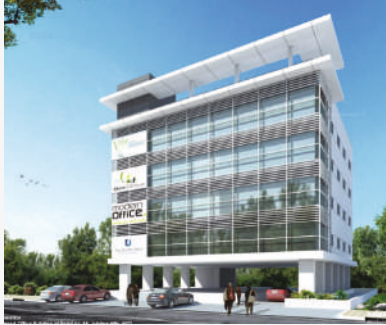
CV TOWER 1 KAVURI HILLS, MADHAPUR