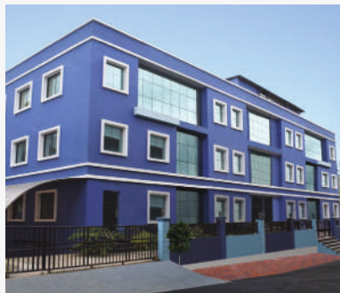
MONSTER.COM JUBILEE HILLS, RD. 45