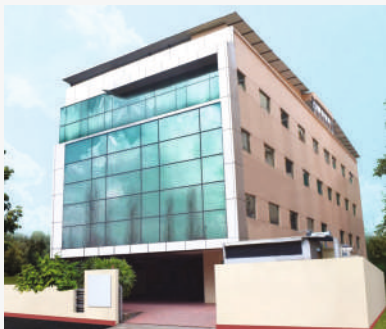
KV TOWER KAVURI HILLS, MADHAPUR