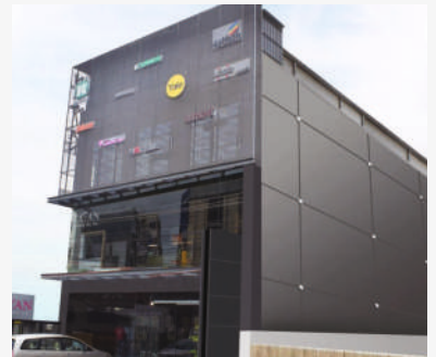
NAYAN HARDWARE KAVURI HILLS, MADHAPUR