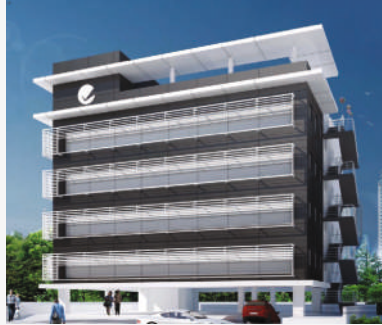
CV TOWER 2 KAVURI HILLS, MADHAPUR