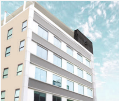
ZEE ENTERTAINMENT KAVURI HILLS, MADHAPUR