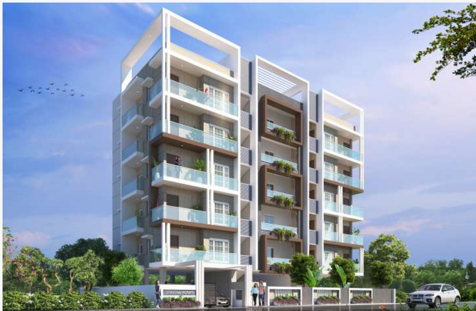
SREE DHRISHA HOMES MIYAPUR