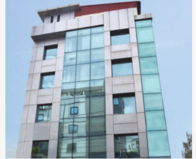
CV TOWER 3 KAVURI HILLS, MADHAPUR