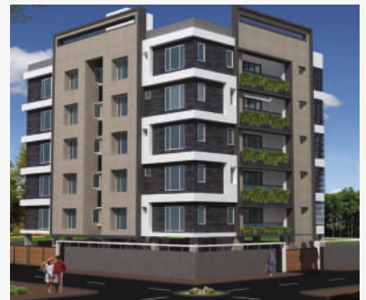
HV HABITAT KAKATIYA HILLS, MADHAPUR